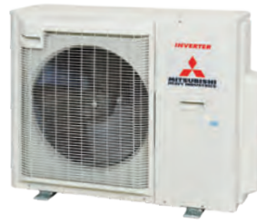
SCM 71-80 ZS-W