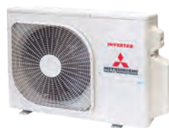
SCM 30-40-45 ZS-W