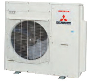
SCM 100 ZS-W