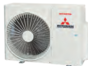
SCM 41-50-60 ZS-W