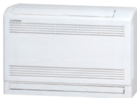
SRF 25-35 ZS-W SRF 50 ZSX-W