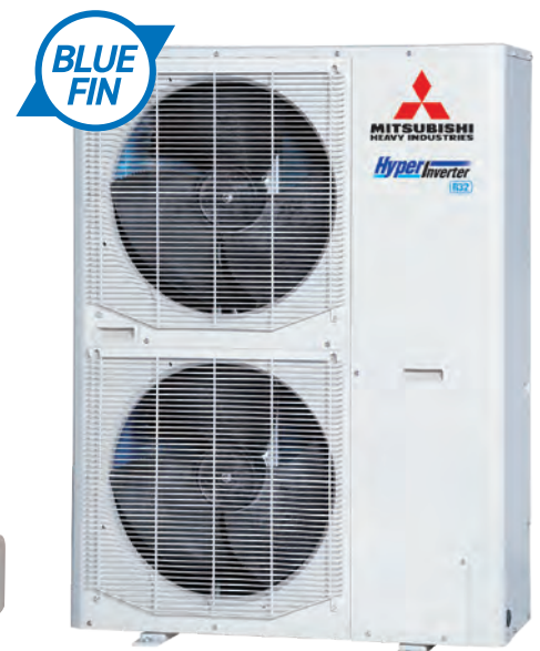
FDC100 VSX-W (4HP) FDC125 VSX-W (5HP) FDC140 VSX-W (6HP)