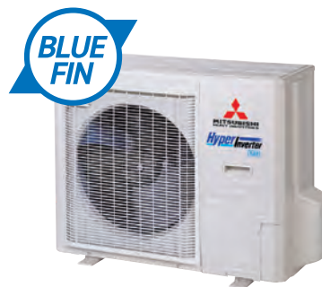
FDC 71 VNX-W (3HP)