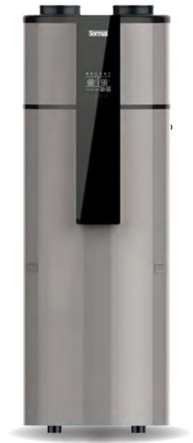
TWMS 2203 J-1 TWMS 2303 J-1 TWMS 2403 J-1