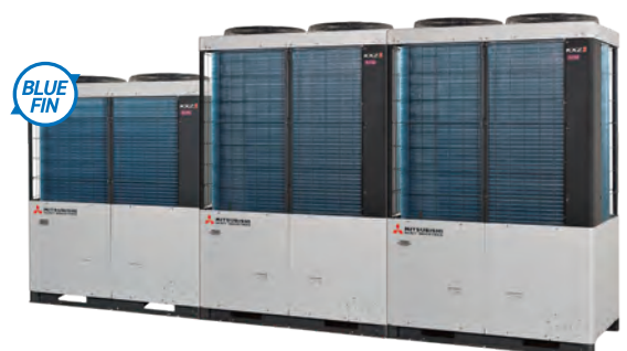
40HP (113.5 kW)