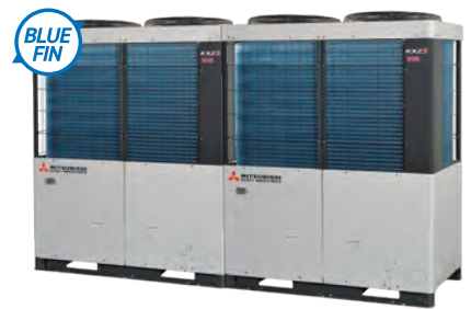
20HP (56.0 kW)