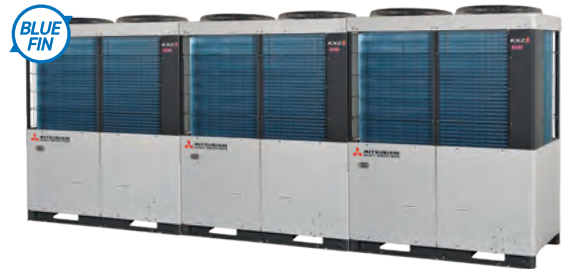
30~36HP (84.0~100.5 kW)