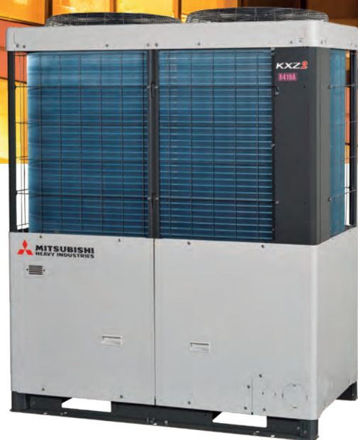
10HP (28.0 kW)

Greater energy efficiency with KXZX2 heat pump systems, in any combination of outdoor units.