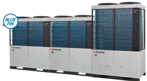
38HP (107.0 kW)