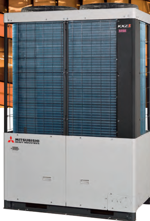
12~14HP (33.5~40.0 kW)