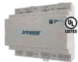
IN776MH100S0000 IN776MH100M0000 IN776MH100L0000