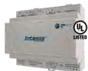
IN776MH100S0000 IN776MH100M0000 IN776MH100L0000