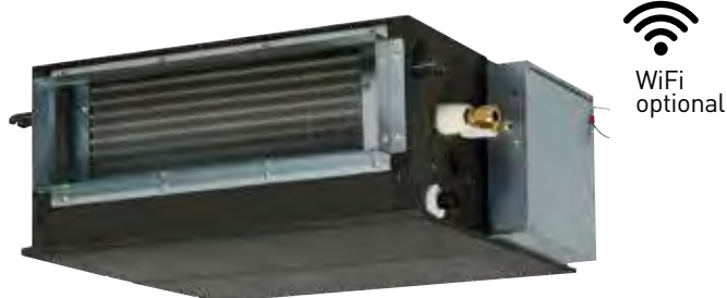
FDUH 22~36 KXE6F