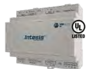
IN776MH100S0000 IN776MH100M0000 IN776MH100L0000