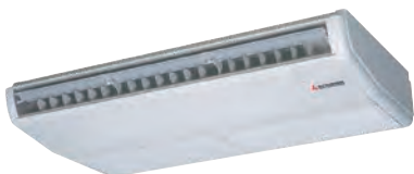
FDE 50 VH