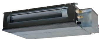
SRR 25-35-50-60 ZS-W