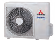
SRC 50-60 ZSX-W3