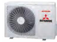
SRC 25-35 ZS-W2