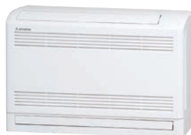
SRF 25-35 ZS-W SRF 50 ZSX-W