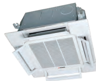
FDTC 25-35 VH1/FDTC 50-60 VH Standard honeycomb panel TC-PSA-5AW-E