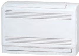
SRF 25-35 ZS-W SRF 50 ZSX-W